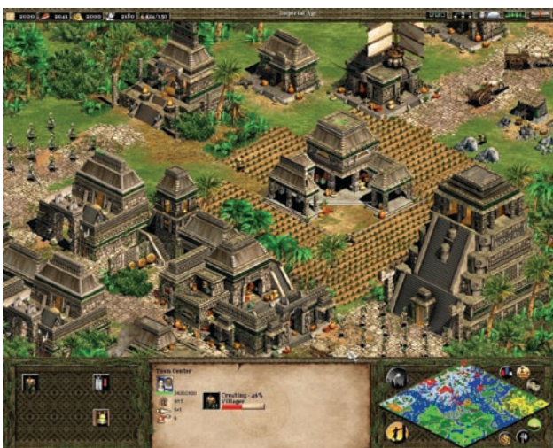
FIGURE 1 Screen capture of Quake III Arena (id Software).

Blink rate and amplitude were recorded with a digital video camera set at 25 images per second, fixed to the frame of the monitor during G1 and G2