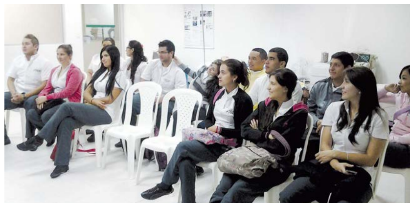
The first web lecture in Latin America covered RGP fitting and corneal topography

For all its success, there are major challenges ahead. IACLE received its first funding in 1992, providing a launch pad for many educational programs and resources worldwide. As funding grew throughout the 90s, it was able to expand its scope but funds have diminished over the past decade as companies have merged and gone through difficult economic times.