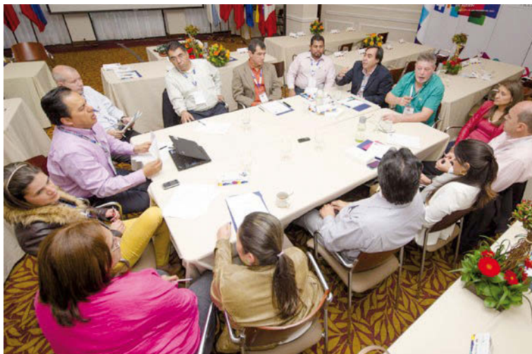
Educators take part in a Train the Trainer meeting in Colombia

As a result, IACLE has had to allocate resources carefully and limit how it grows its presence. Current platinum sponsor Alcon, silver sponsors Cooper Vision and The Vision Care Institute of Johnson & Johnson Vision Care, and bronze sponsor Bausch + Lomb together continue to support IACLE. To expand its activities once again, it has modified its funding structure in the hope of attracting new sponsors.