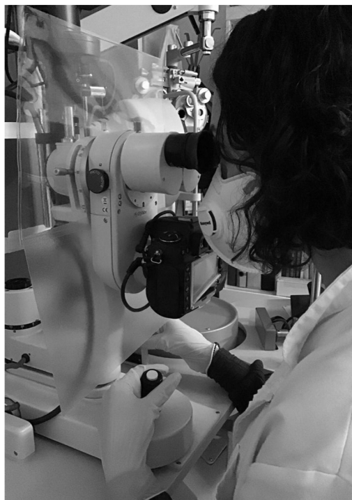
Fig. 2. A large clear plastic sheet, working as a protective shield, has been cut and placed between the ocular and slit lamp [9,10].

This outbreak is evolving rapidly, the impact to the public health risks to be massive with huge economic and social disruption. In the