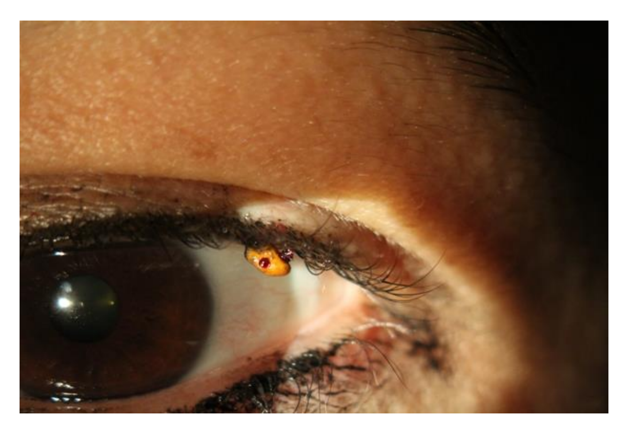
Tick burrowed on the upper eyelid margin

FIACLE Ajay Shinde of Sankara College of Optometry, Bangalore, India captured this image using a photo slit lamp with Canon camera mounted. This 46-year-old female patient visited the clinic complaining of pain in the left upper eyelid for the past three days. On examination a tick was found on the upper lid margin with one of its tiny legs moving. A gentle touch on the upper lid was very painful. A thorough history revealed the patient had interacted with pets (cats) about a week previously at a relative's house.